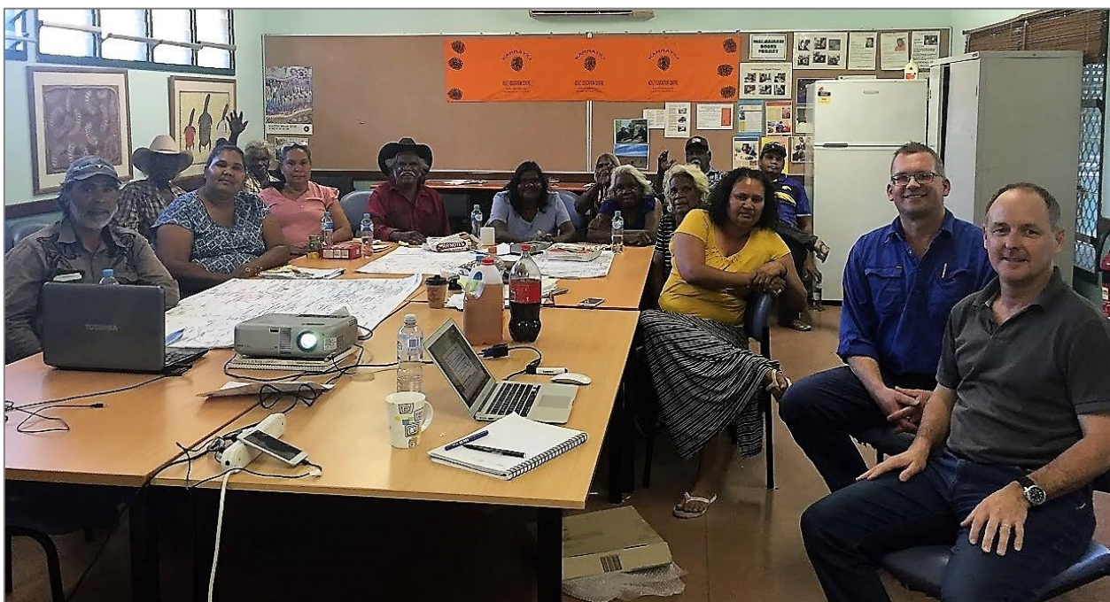
Photo taken at a consultative meeting with members of the GAC in August 2018 (photo used with permission).

The GAC are the Native Title Prescribed Body Corporate for the Gooniyandi Traditional Owners who are the Registered Native Title Claimants for the project area.