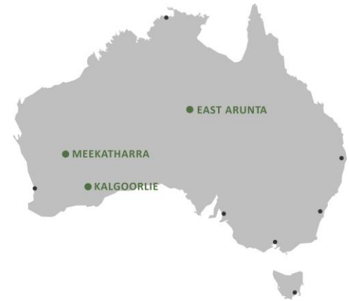
Figure 1: Project Location Plan

Mithril Resources (“Mithril” or “the Company”) is exploring for copper-nickel-PGE mineralisation at the Nanadie Well Project (Meekatharra), gold at Duffy Well (Meekatharra) and Spargos Reward (Kalgoorlie), and nickel at Kurnalpi (Kalgoorlie), all of which are located within the southern half of Western Australia (Figure 1).