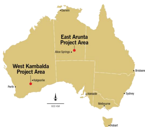
Figure 1: Project Location Plan

Mithril looks forward to informing the market when the drilling commences.