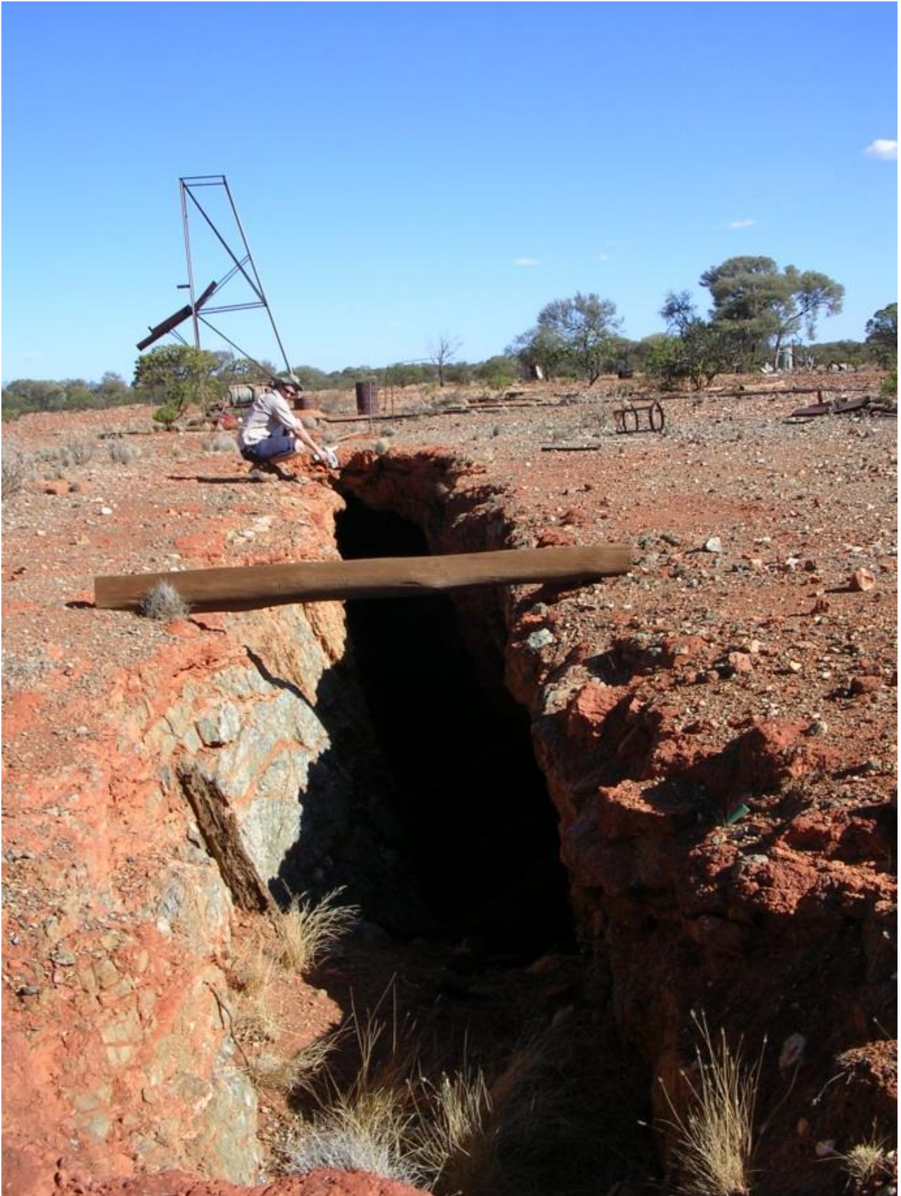
Figure 2: Kombi Gold Prospect – historic workings looking southeast towards the soil anomaly in the background.